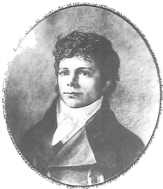
F. W. J. Schelling