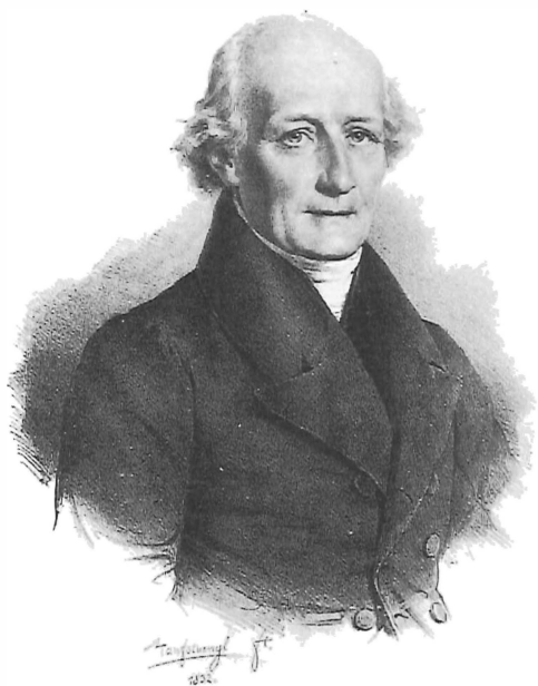
Immanuel Niethammer (Stadtarchiv Stuttgart)