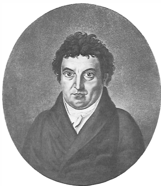
J. G. Fichte