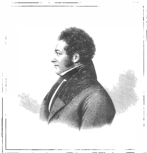
DR. EDUARD GANS Professor der Rechte an der Universität zu Berlin.

Eduard Gans