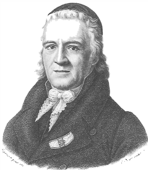
K. L. Reinhold