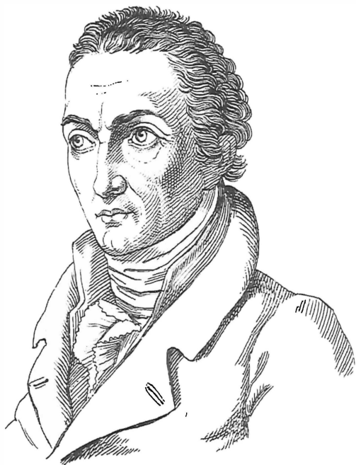
H. E. G. Paulus