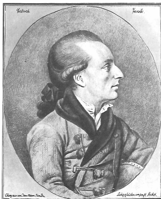
F. H. Jacobi