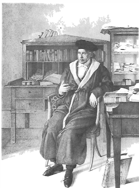
Hegel: lithograph by L. Sebbers