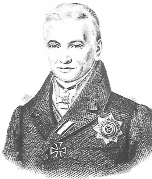
K. S. von Stein zum Altenstein