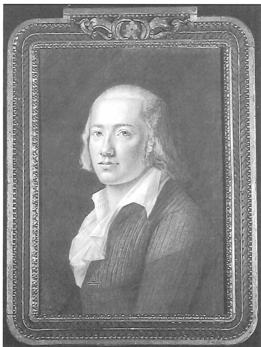
Friedrich Hölderlin (Schiller Nationalmu- seum, Marbach am Neckar)