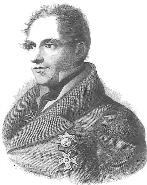
K. A. Varnhagen von Ense